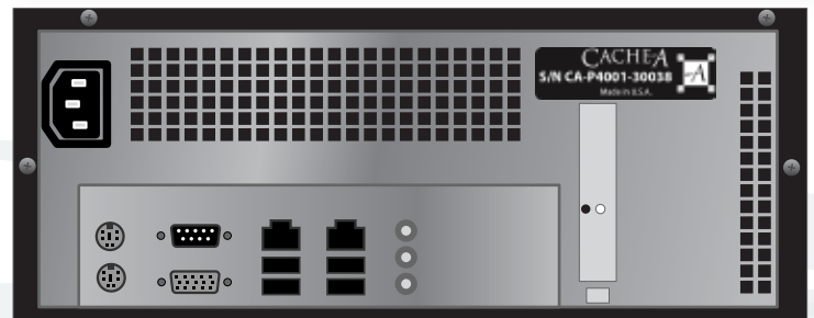
Power Service Gb E 1 Gb E 0 Tape Mouse Service USB3 USB5 SAS Keyboard Monitor USB4 USB6 Adaptor