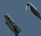
AJ-MA75P Rack Mount Adaptor (slide rail, not included)